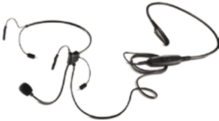
Behind-the-head Lightweight Headset PMLN5392

The benefits and assurance of the ATEX certification will be invalidated by using non-approved accessories. The Motorola ATEX accessories for the MTP850Ex have been fully tested to meet the ATEX standards. These can be used with confidence in gas and dust explosive risk areas.